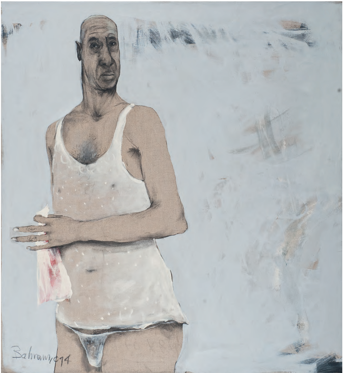
Man | 2013/14 | mixedmedia/canvas | 120 cm x 110 cm