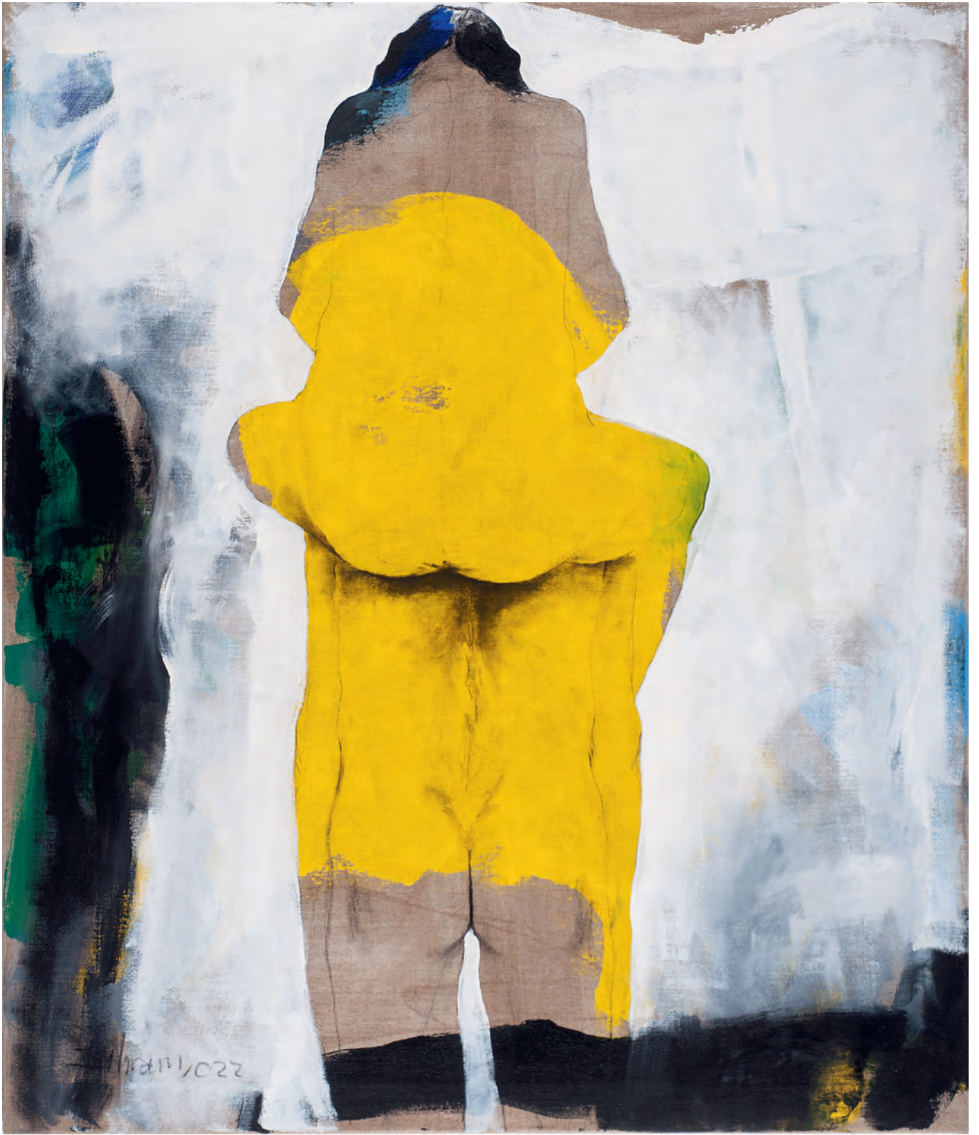
Untitled | 2022 | mixedmedia/canvas | 140 cm x 120 cm