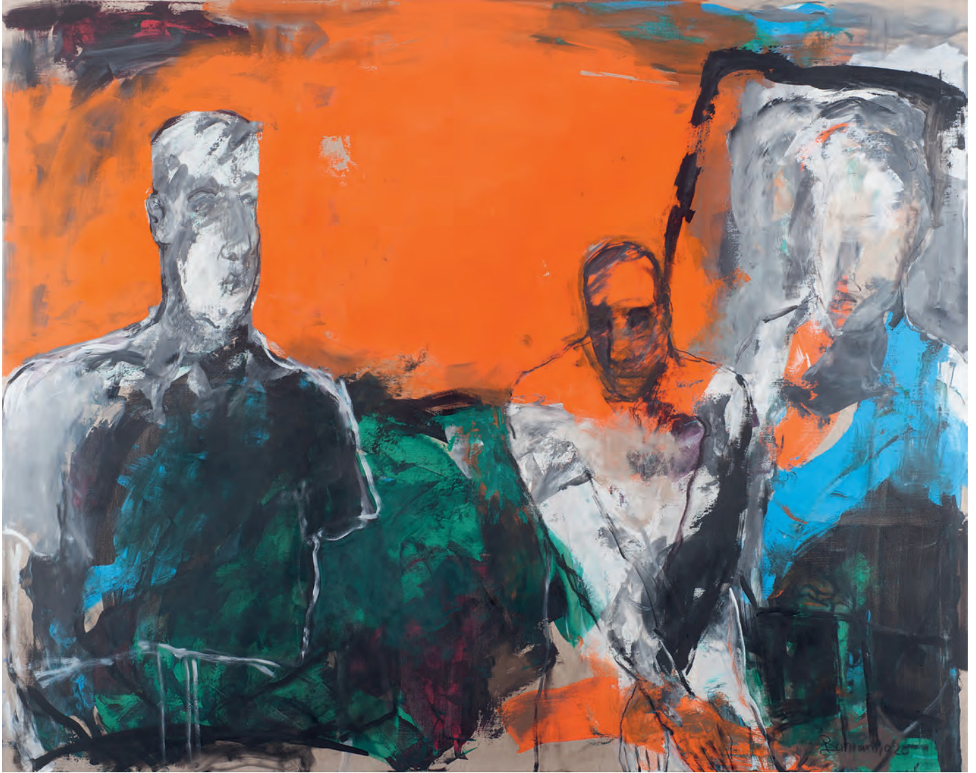
Untitled | 2020 | mixedmedia/canvas | 160 cm x 200 cm