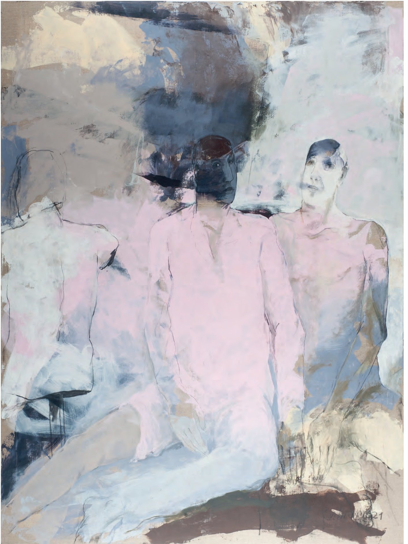
Untitled | 2021 | mixedmedia/canvas | 200 cm x 150 cm