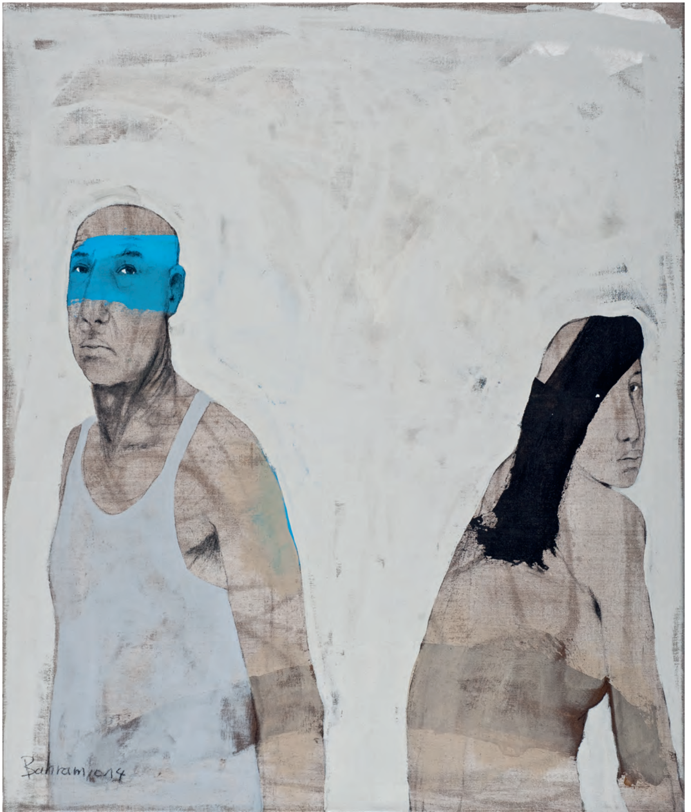
Untitled | 2014 | mixedmedia/canvas | 120 cm x 100 cm