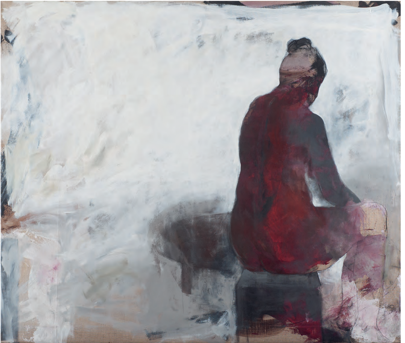
Untitled | 2021 | mixedmedia/canvas | 120 cm x 140 cm