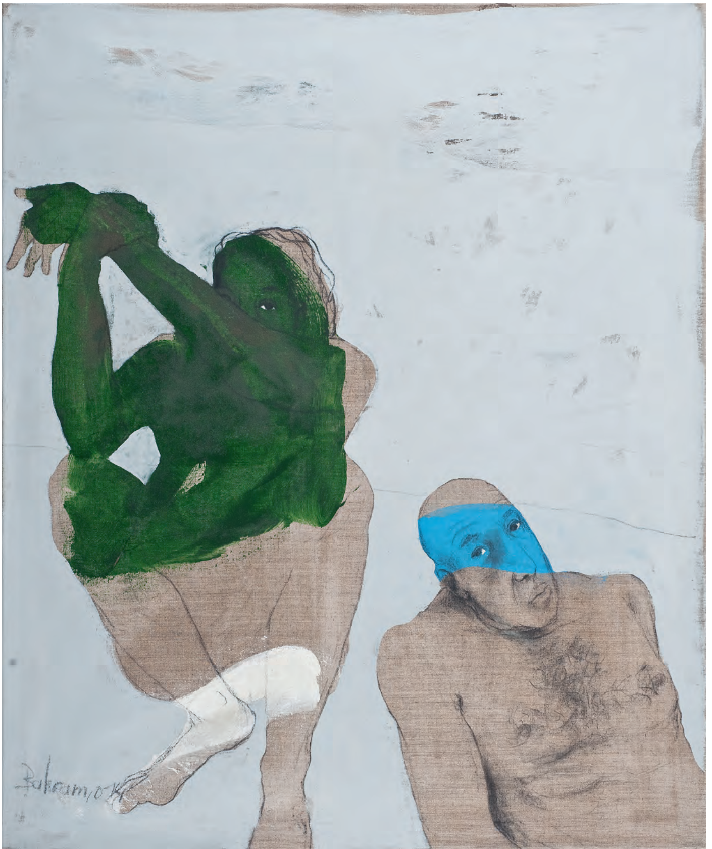
Untitled | 2014 | mixedmedia/canvas | 120 cm x 100 cm