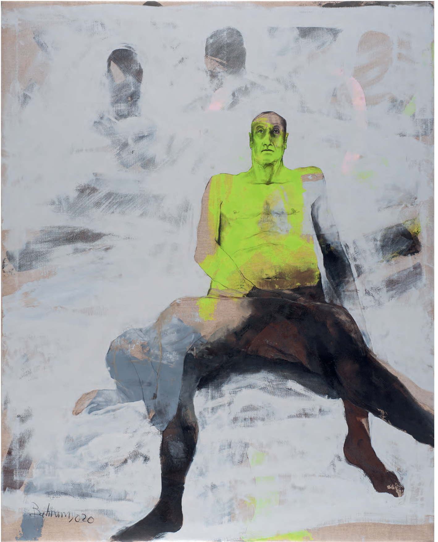
Untitled | 2020 | mixedmedia/canvas | 200 cm x 160 cm