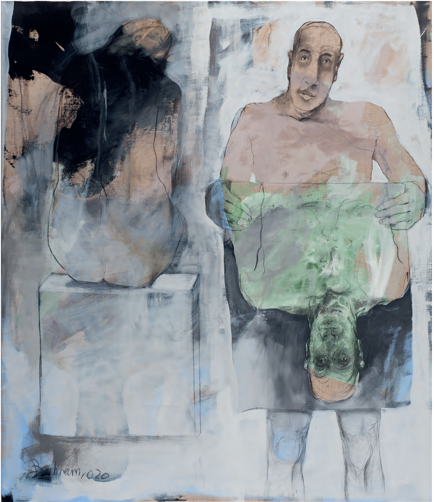
Untitled | 2020 | mixedmedia/canvas | 140 cm x 120 cm