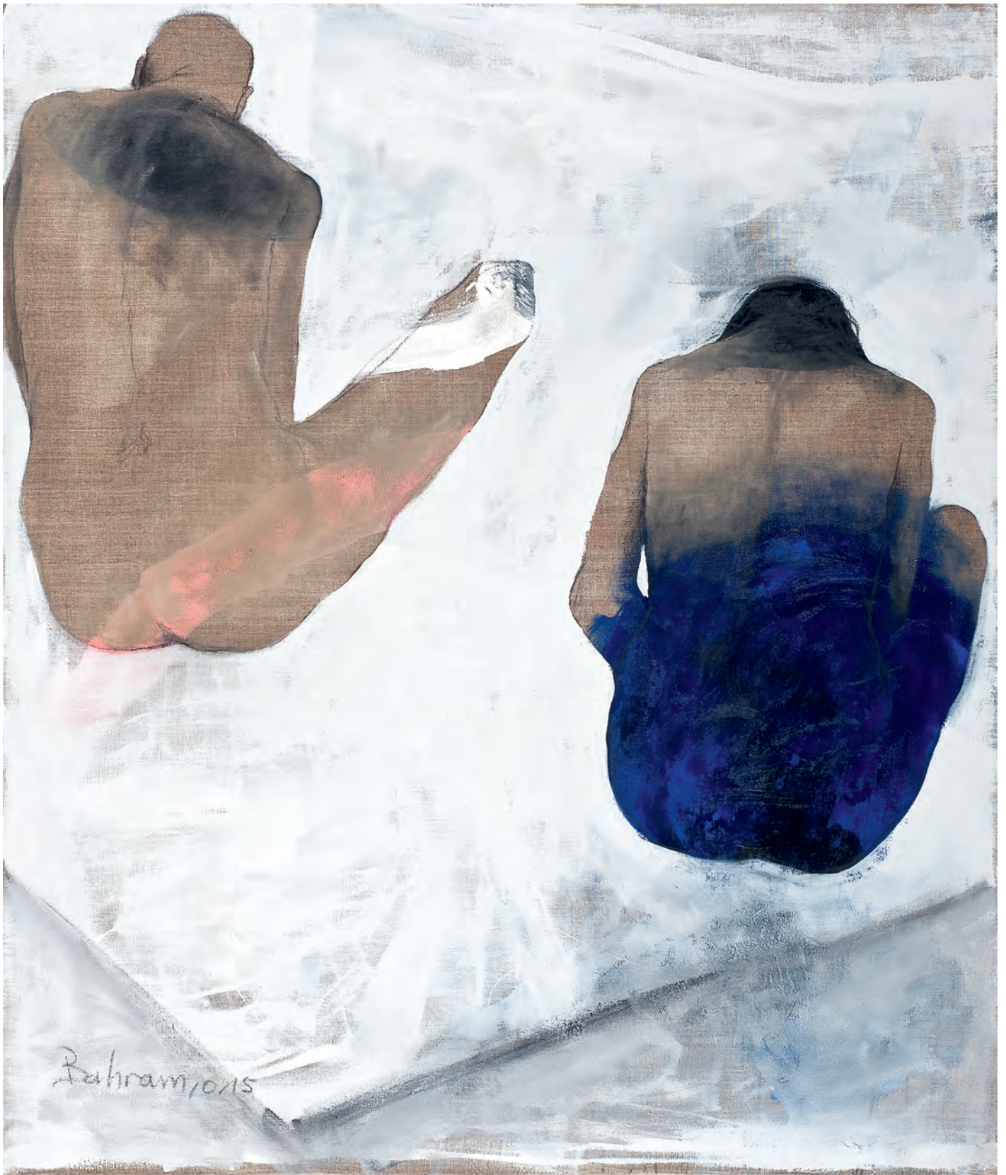
Couple | 2015 | mixedmedia/canvas | 140 cm x 120 cm