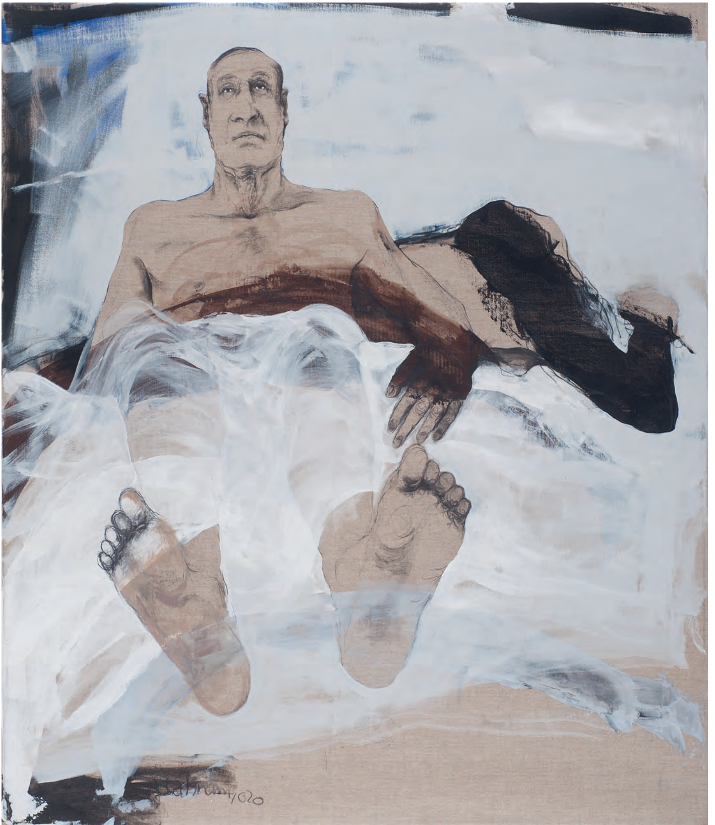
Untitled | 2020 | mixedmedia/canvas | 140 cm x 120 cm