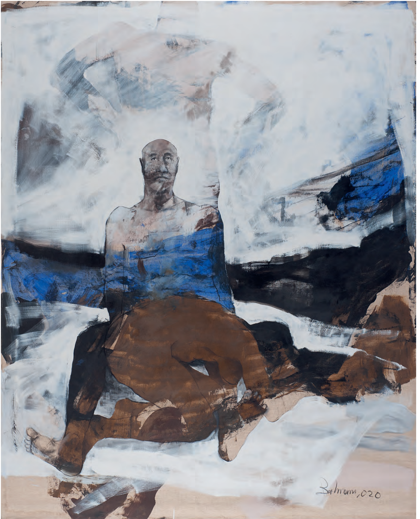
Untitled | 2020 | mixedmedia/canvas | 200 cm x 160 cm