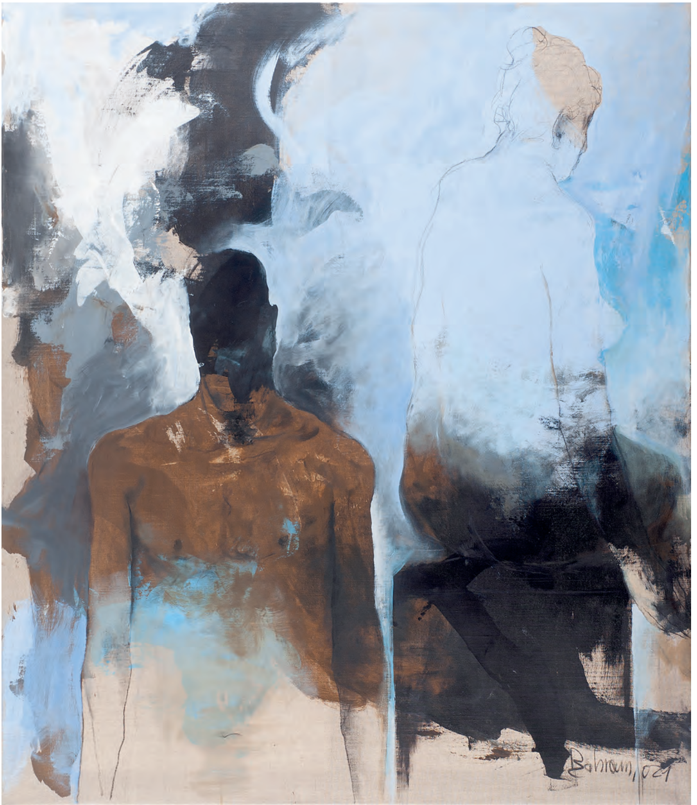
Untitled | 2021 | mixedmedia/canvas | 140 cm x 120 cm