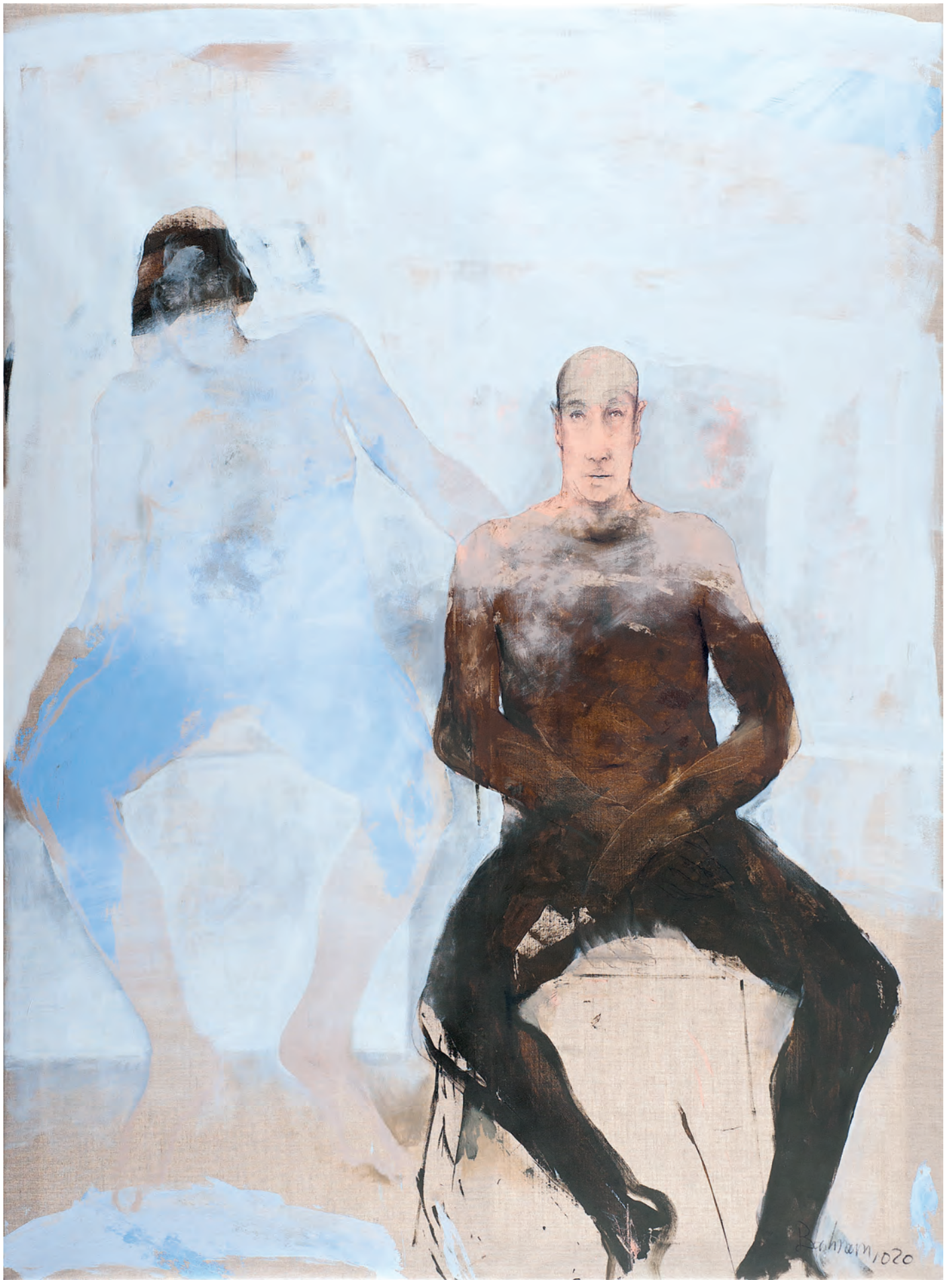
Untitled | 2020 | mixedmedia/canvas | 200 cm x 150 cm