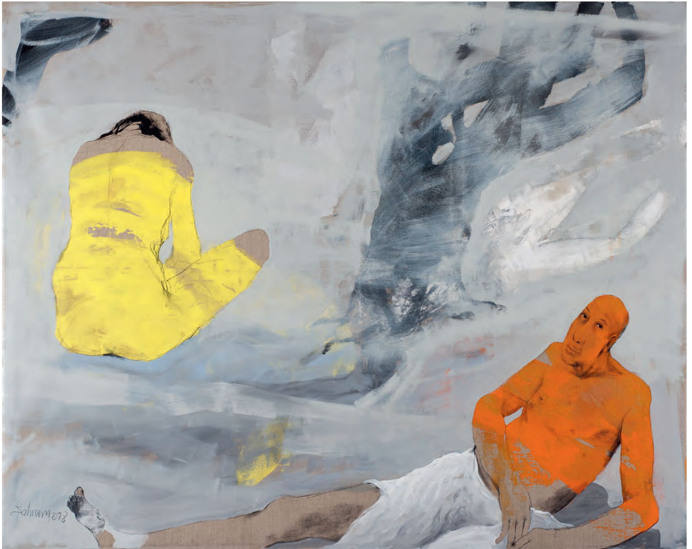
Untitled | 2018 | mixedmedia/canvas | 160 cm x 200 cm