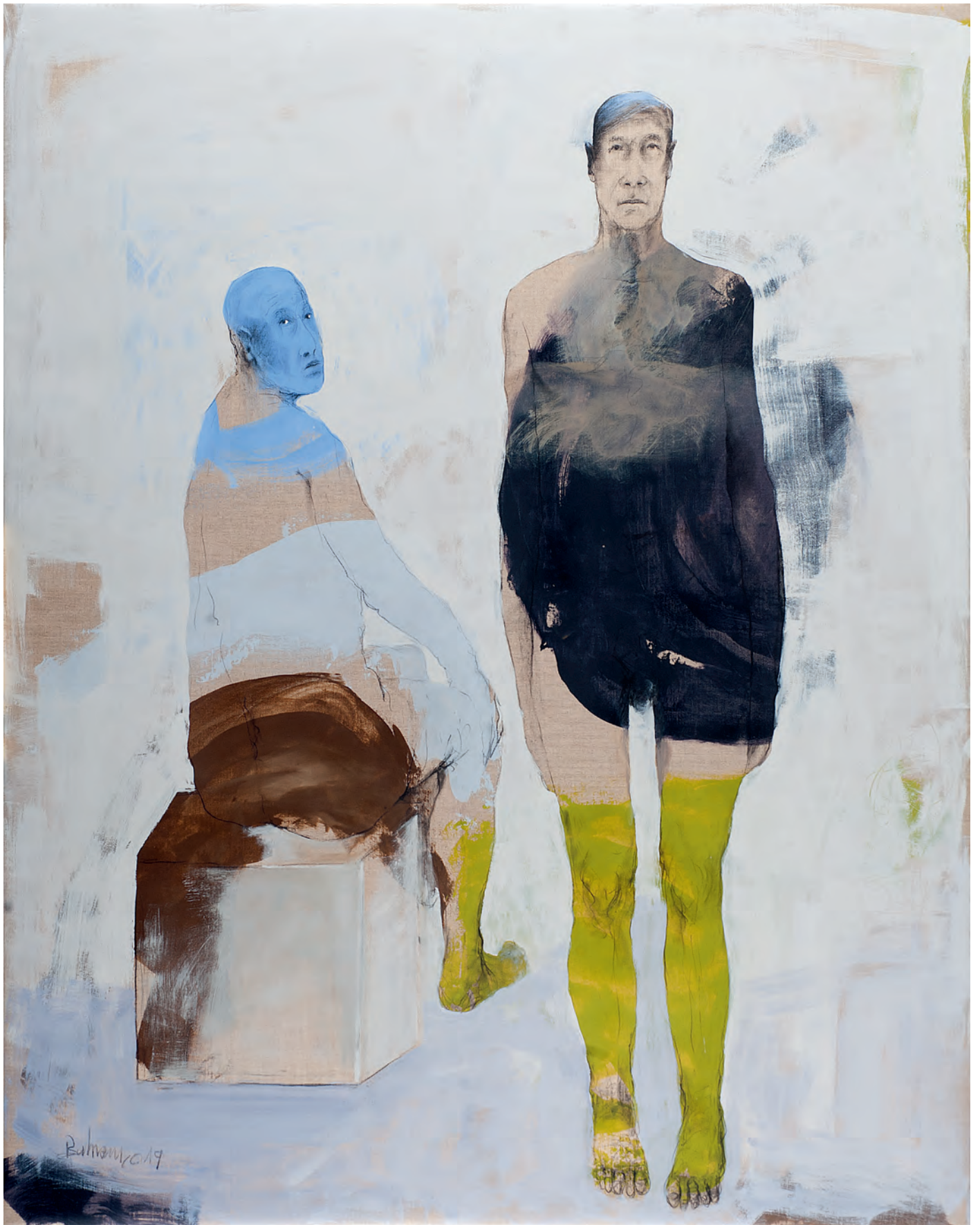
Untitled | 2019 | mixedmedia/canvas | 200 cm x 160 cm