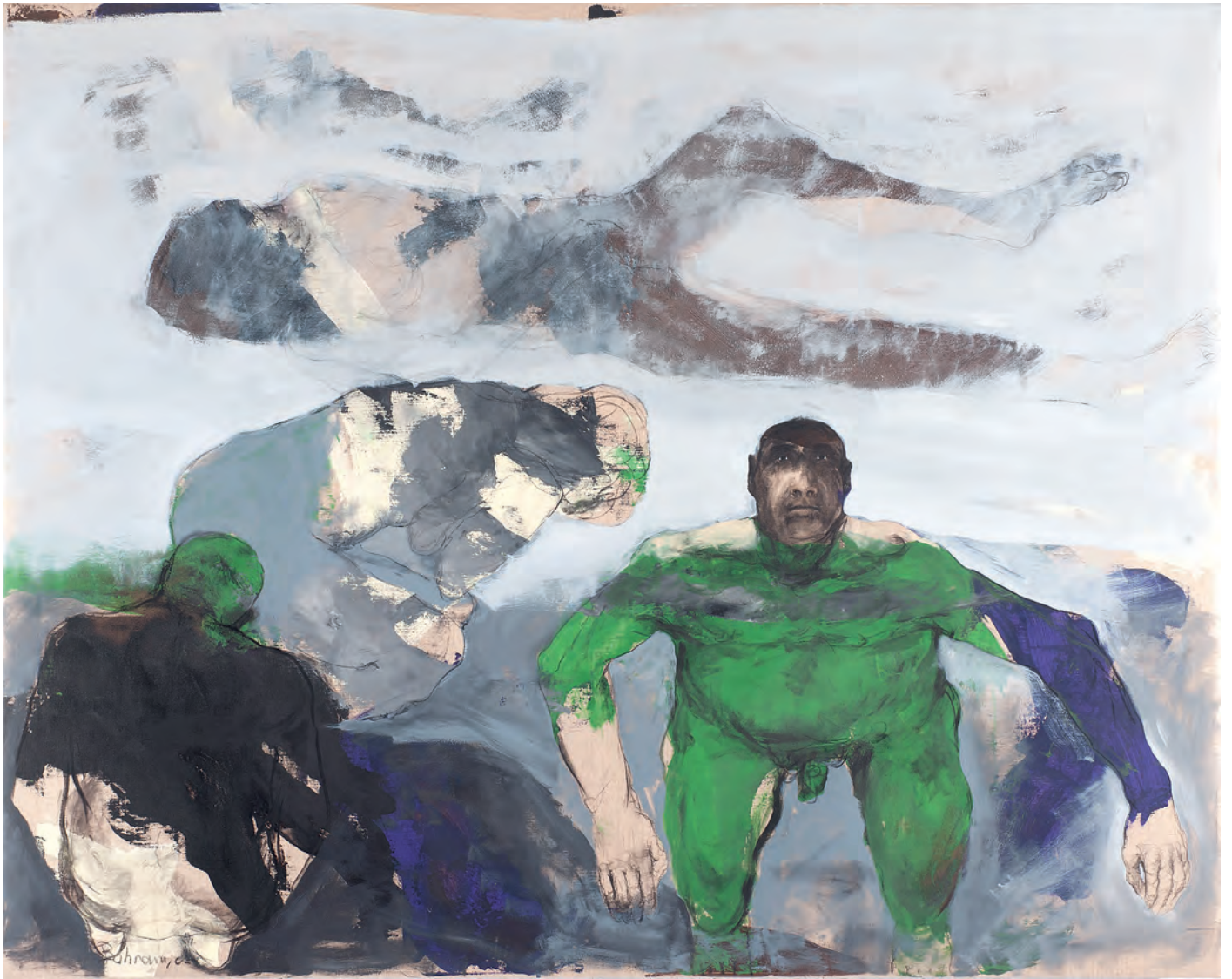
Untitled | 2021 | mixedmedia/canvas | 160 cm x 200 cm