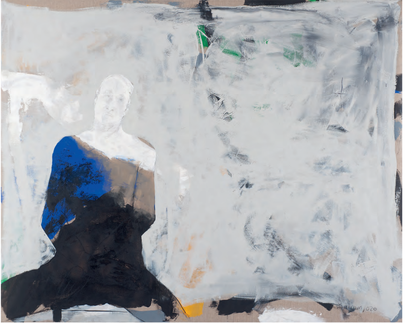
Untitled | 2020 | mixedmedia/canvas | 160 cm x 200 cm