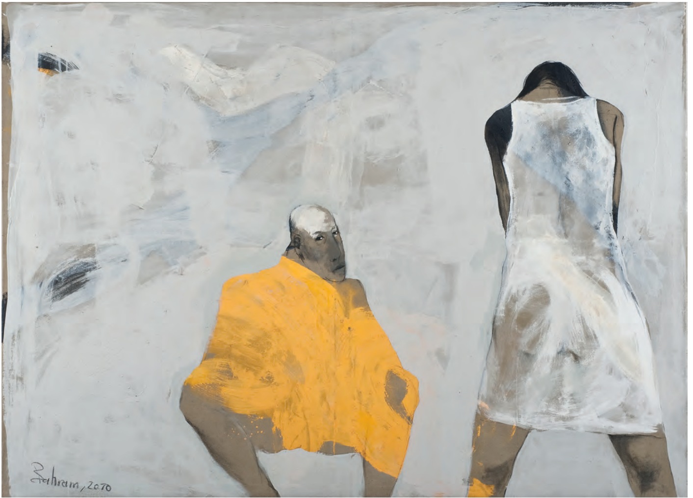
Untitled | 2010 | mixedmedia/canvas | 140 cm x 200 cm