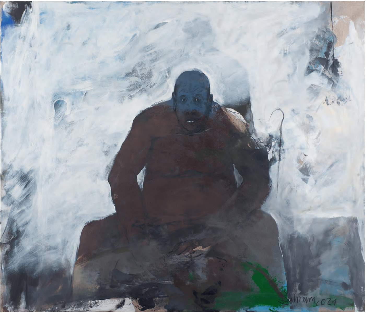
Untitled | 2021 | mixedmedia/canvas | 120 cm x 140 cm