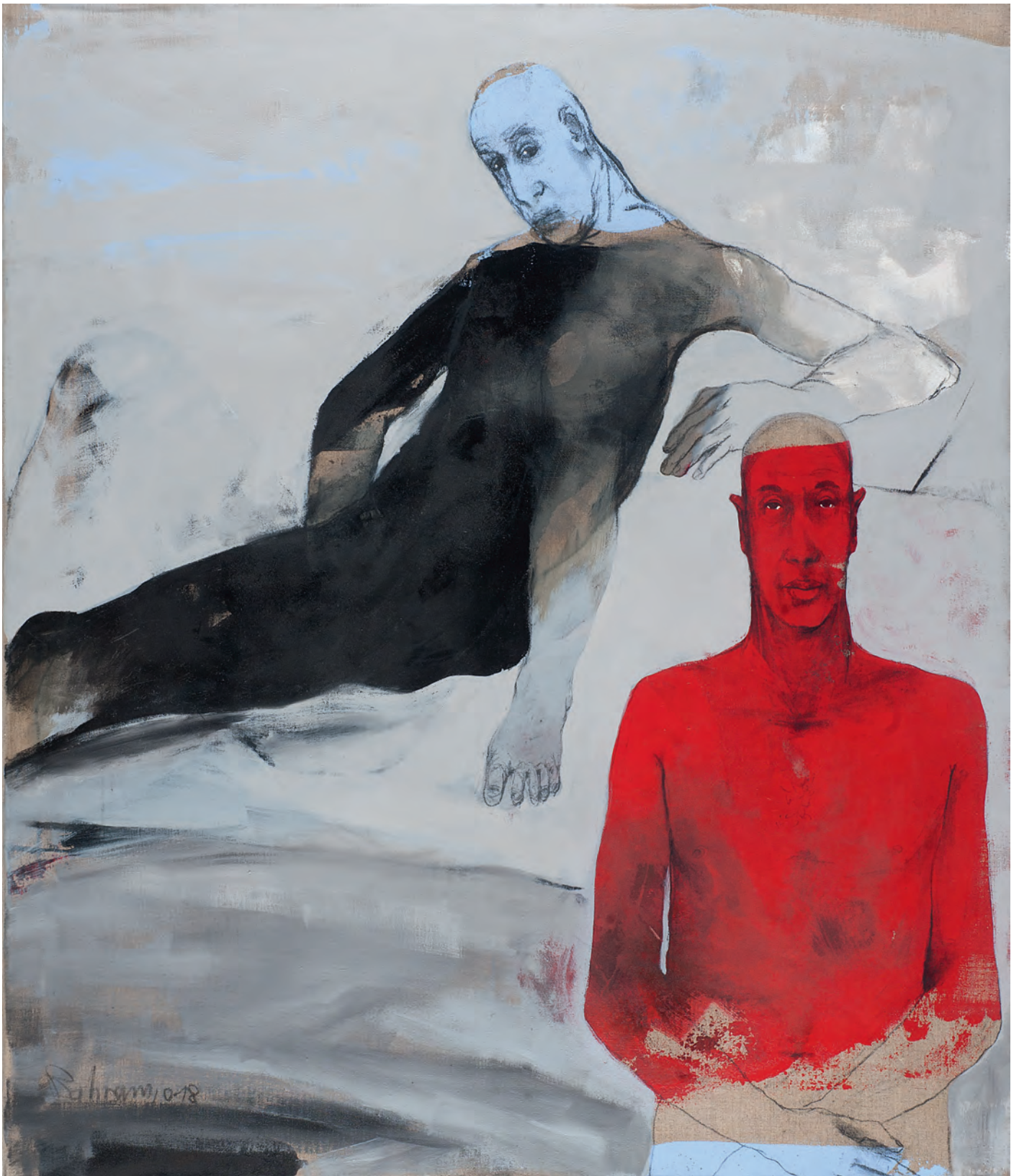
Untitled | 2018 | mixedmedia/canvas | 145 cm x 125 cm