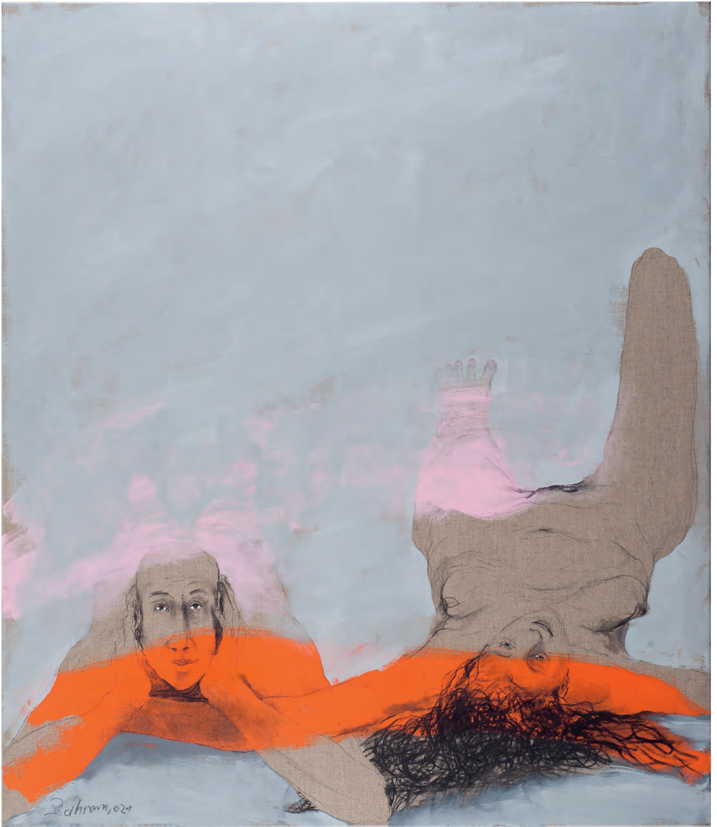
Untitled | 2021 | mixedmedia/canvas | 140 cm x 120 cm