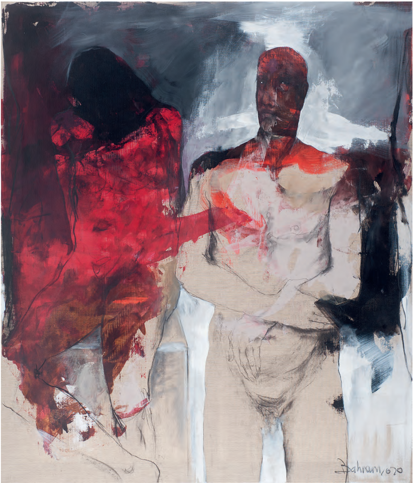
Untitled | 2020 | mixedmedia/canvas | 140 cm x 120 cm