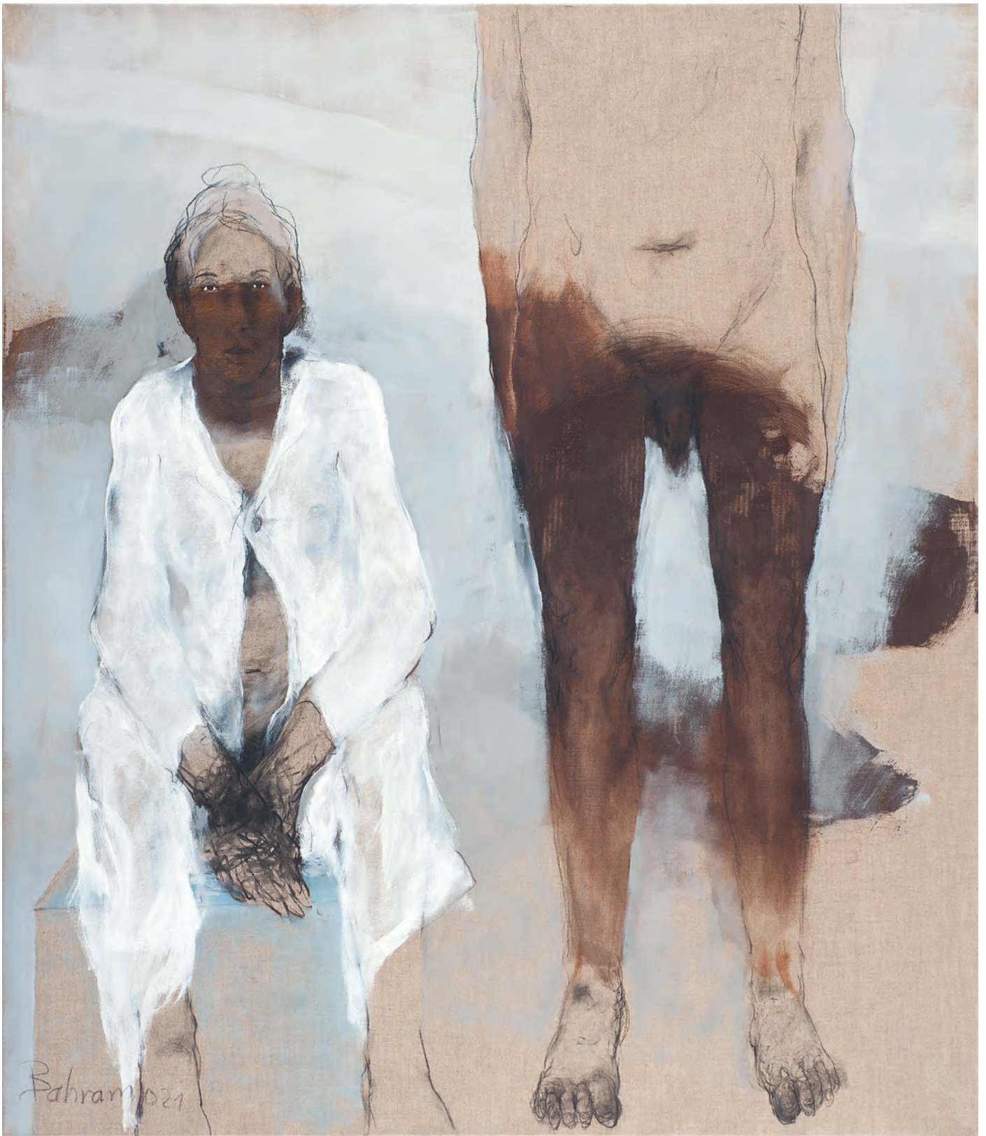
Untitled | 2021 | mixedmedia/canvas | 140 cm x 120 cm