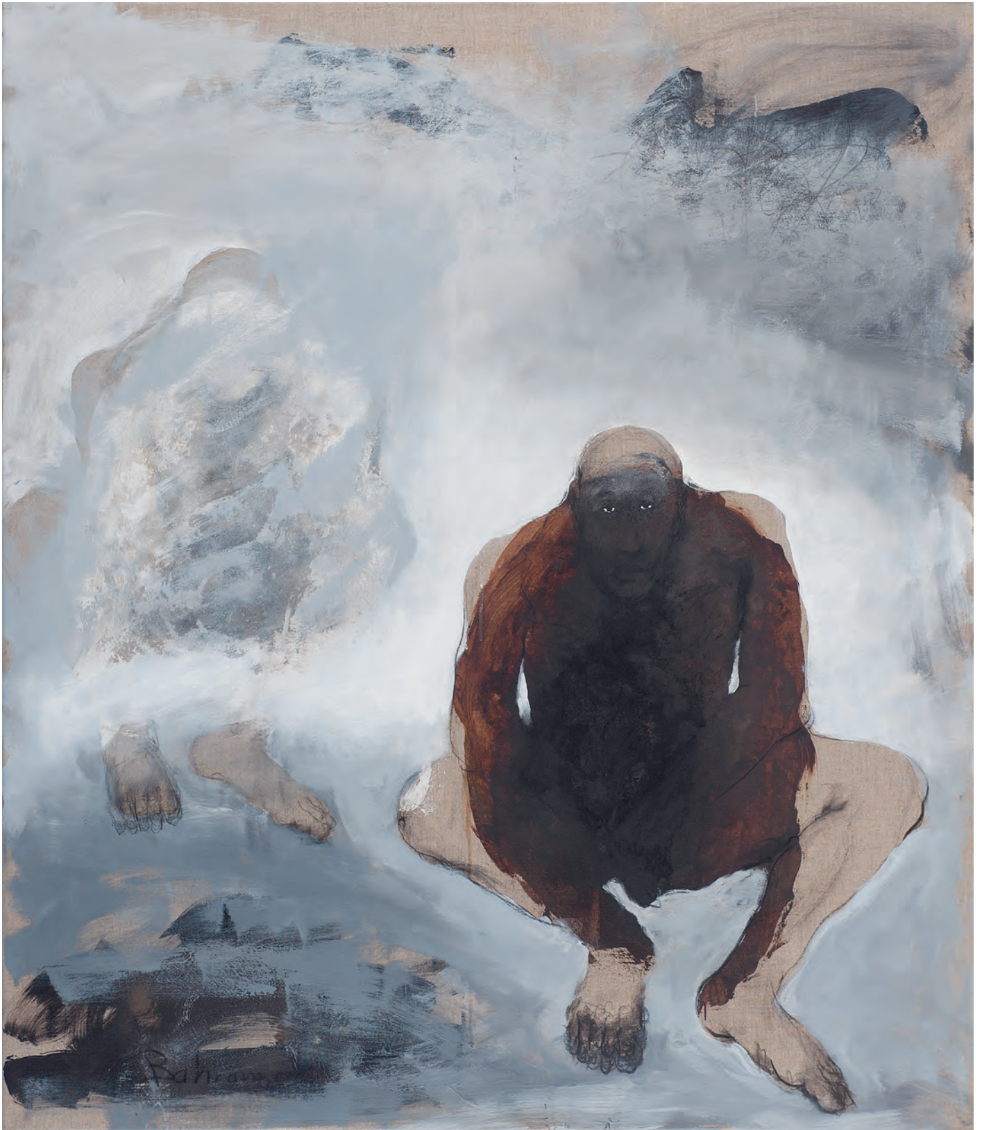
Untitled | 2020 | mixedmedia/canvas | 140 cm x 120 cm