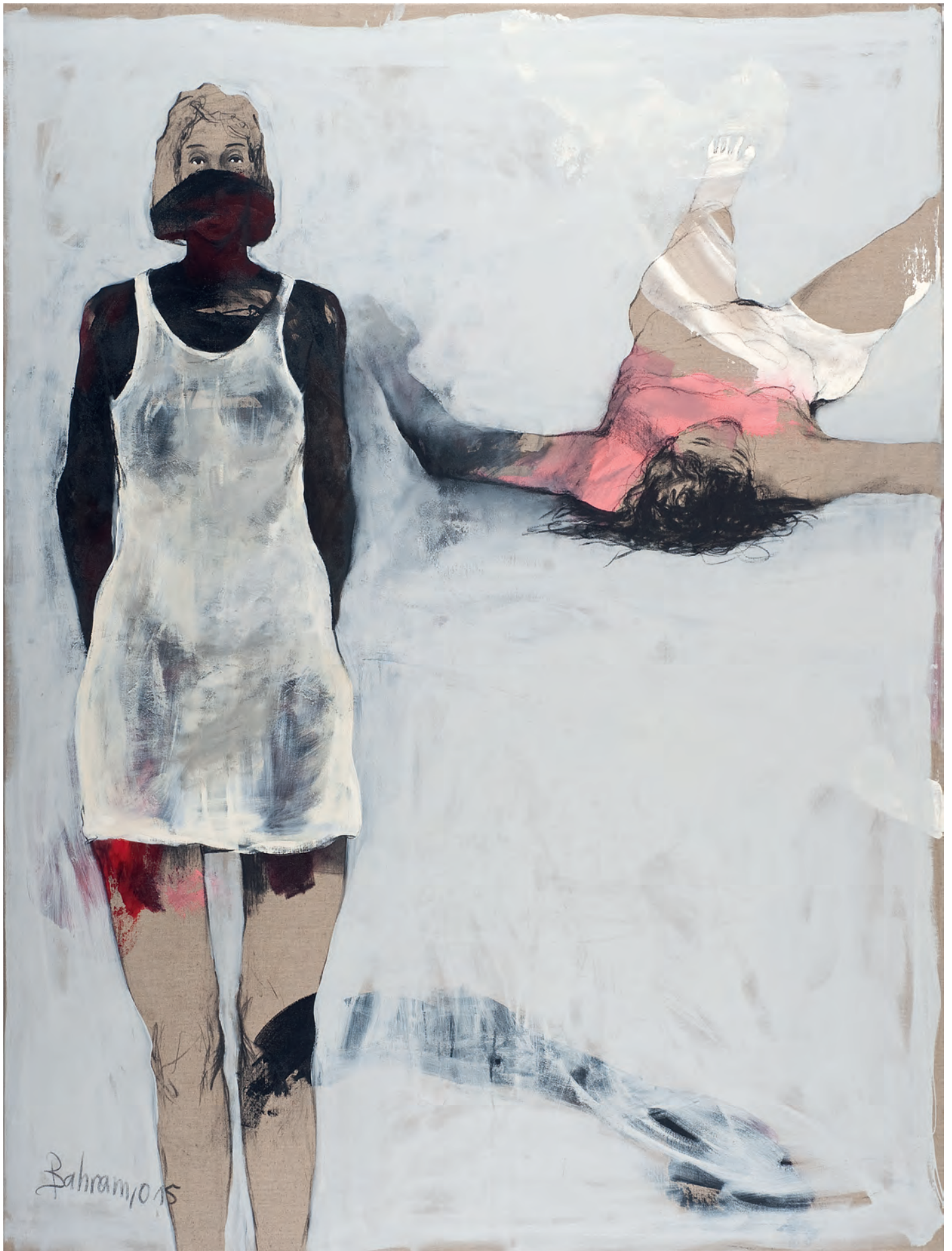
Untitled | 2015 | mixedmedia/canvas | 210 cm x 150 cm