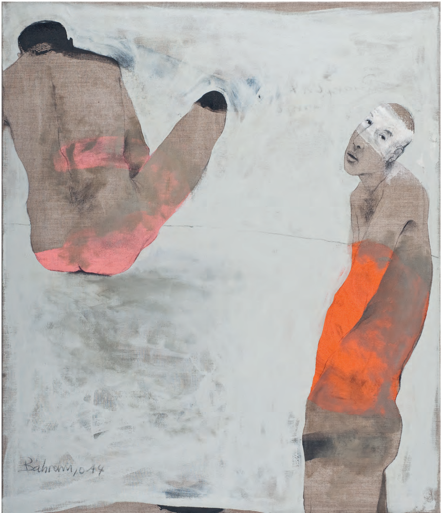
Untitled | 2014 | mixedmedia/canvas | 140 cm x 120 cm