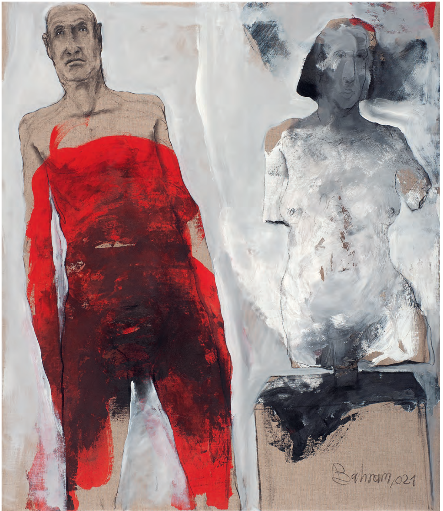
Untitled | 2021 | mixedmedia/canvas | 140 cm x 120 cm