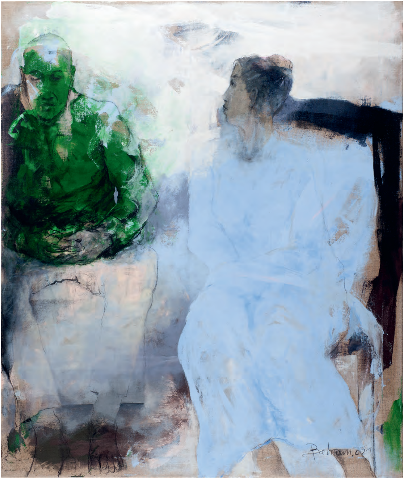
Untitled | 2021 | mixedmedia/canvas | 140 cm x 120 cm