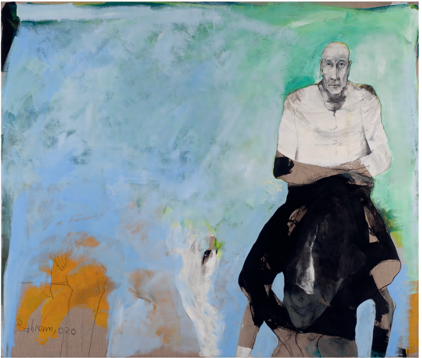
Untitled | 2020 | mixedmedia/canvas | 170 cm x 200 cm