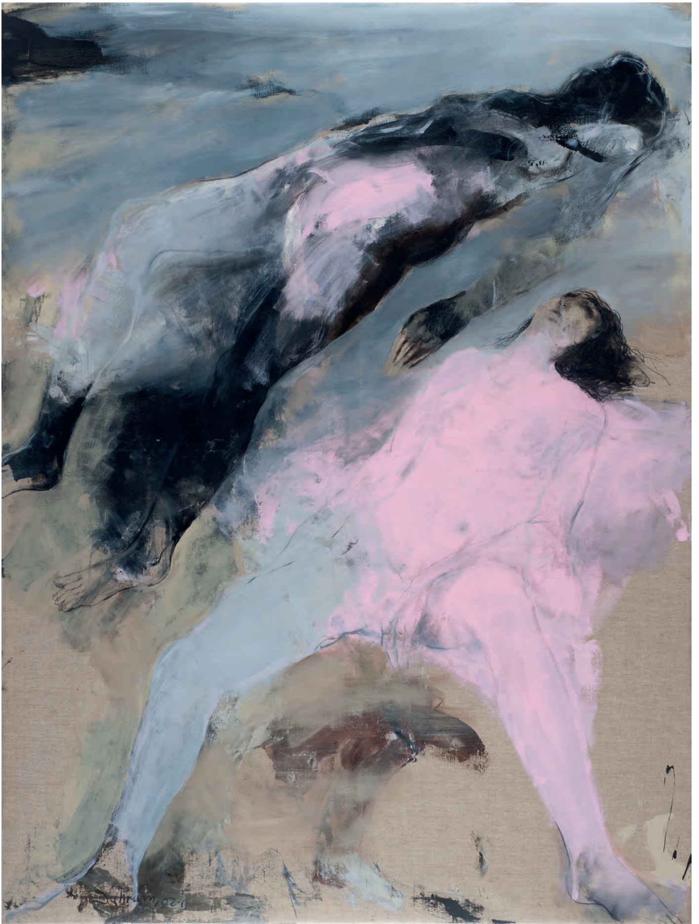
Untitled | 2021 | mixedmedia/canvas | 200 cm x 150 cm