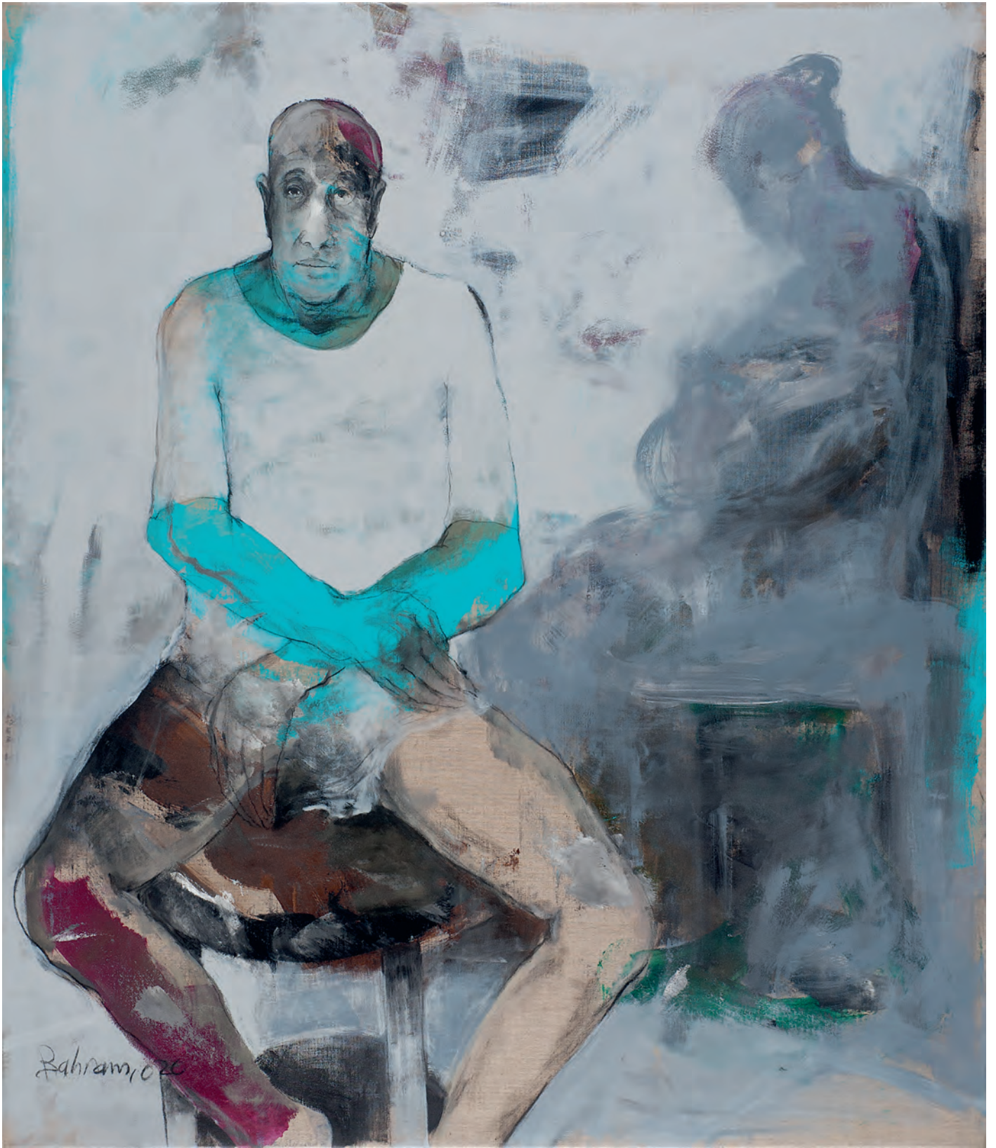
Untitled | 2020 | mixedmedia/canvas | 140 cm x 120 cm