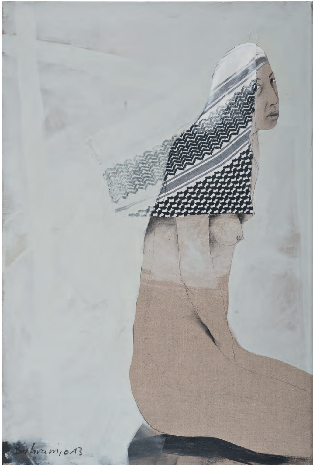
Woman | 2013/14 | mixedmedia/canvas | 120 cm x 80 cm