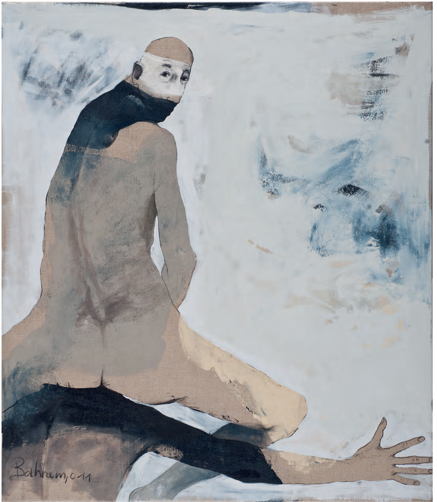
Untitled | 2011 | mixedmedia/canvas | 140 cm x 120 cm