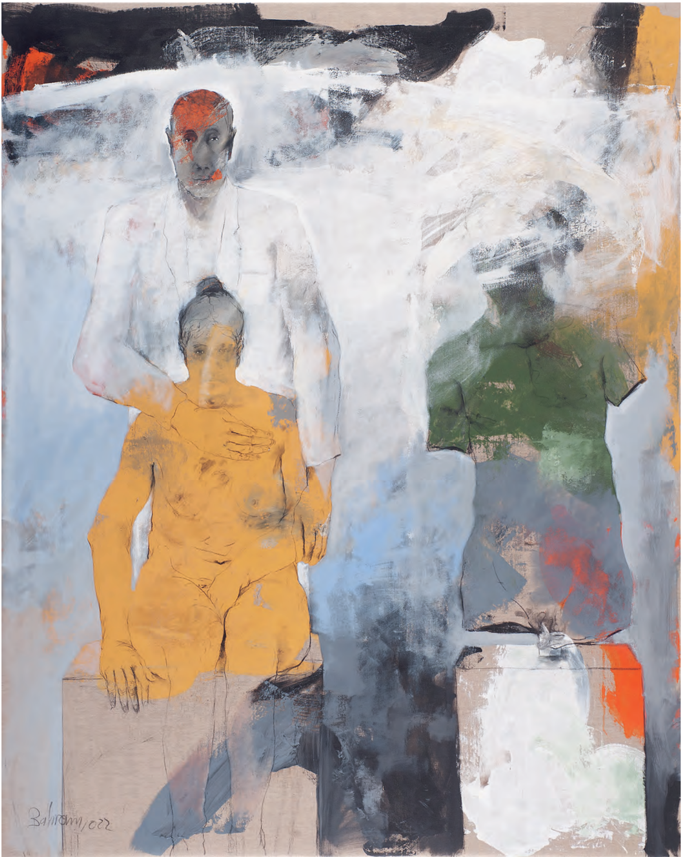
Untitled | 2022 | mixedmedia/canvas | 200 cm x 160 cm