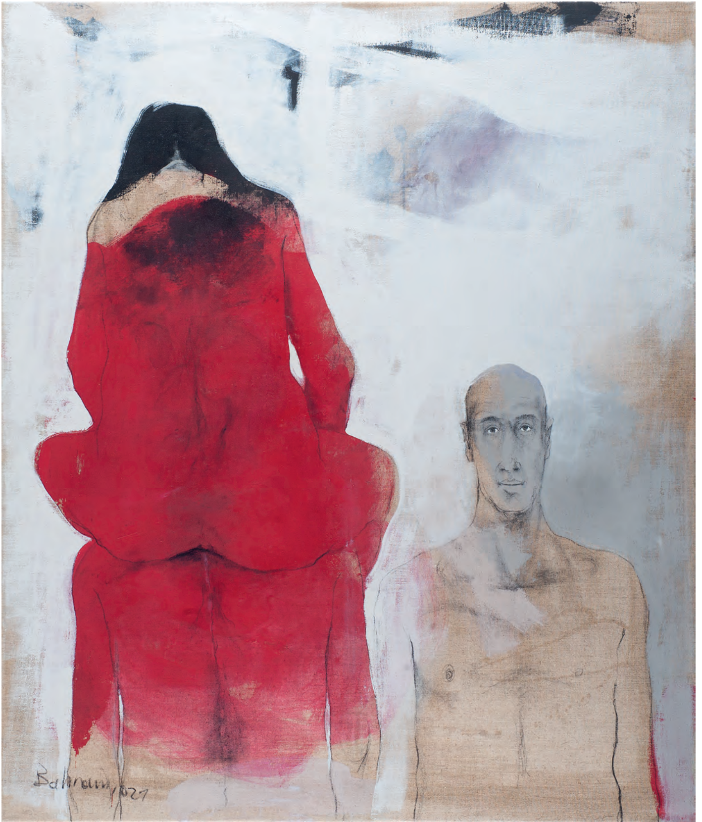
Untitled | 2021 | mixedmedia/canvas | 140 cm x 120 cm