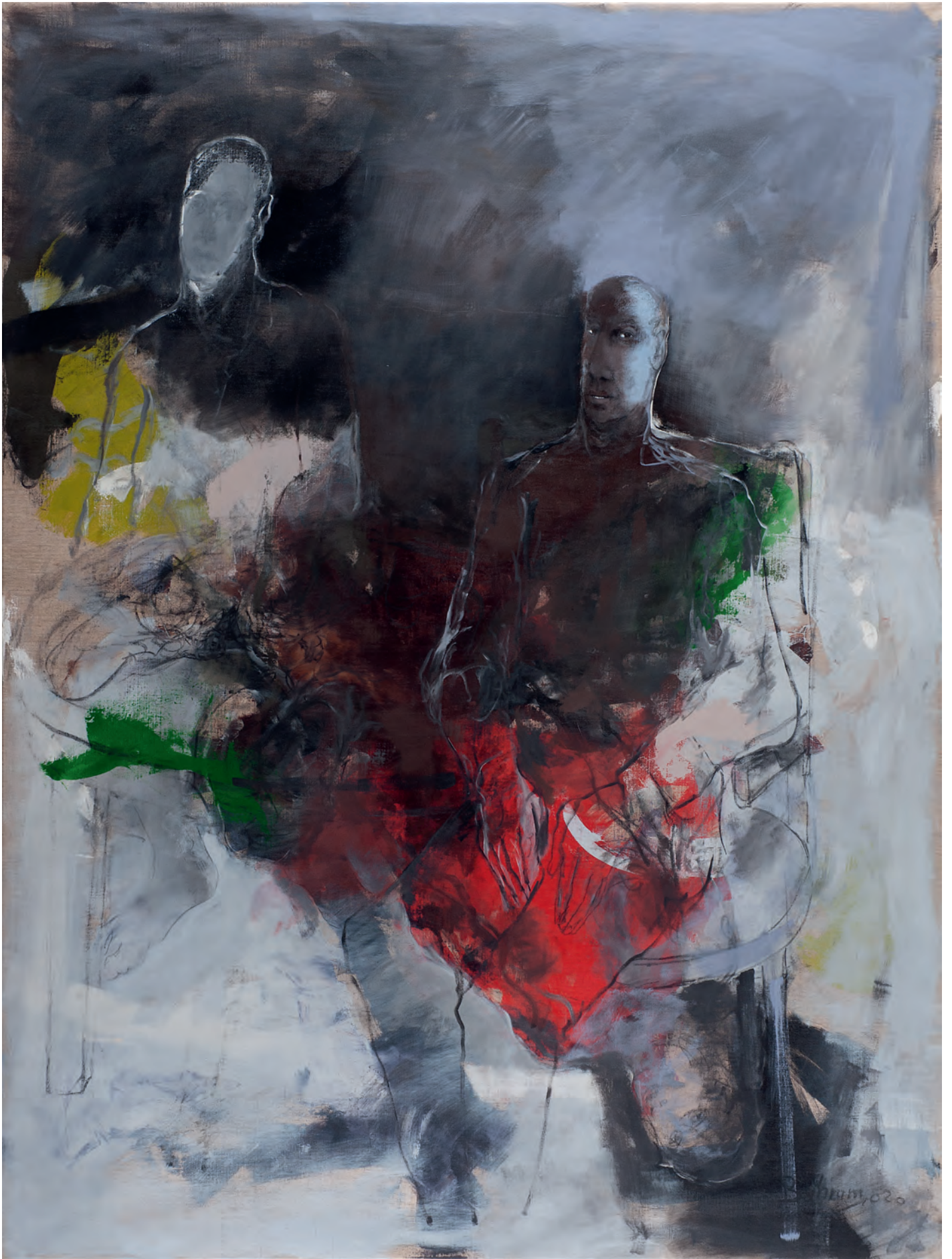
Untitled | 2020 | mixedmedia/canvas | 200 cm x 150 cm