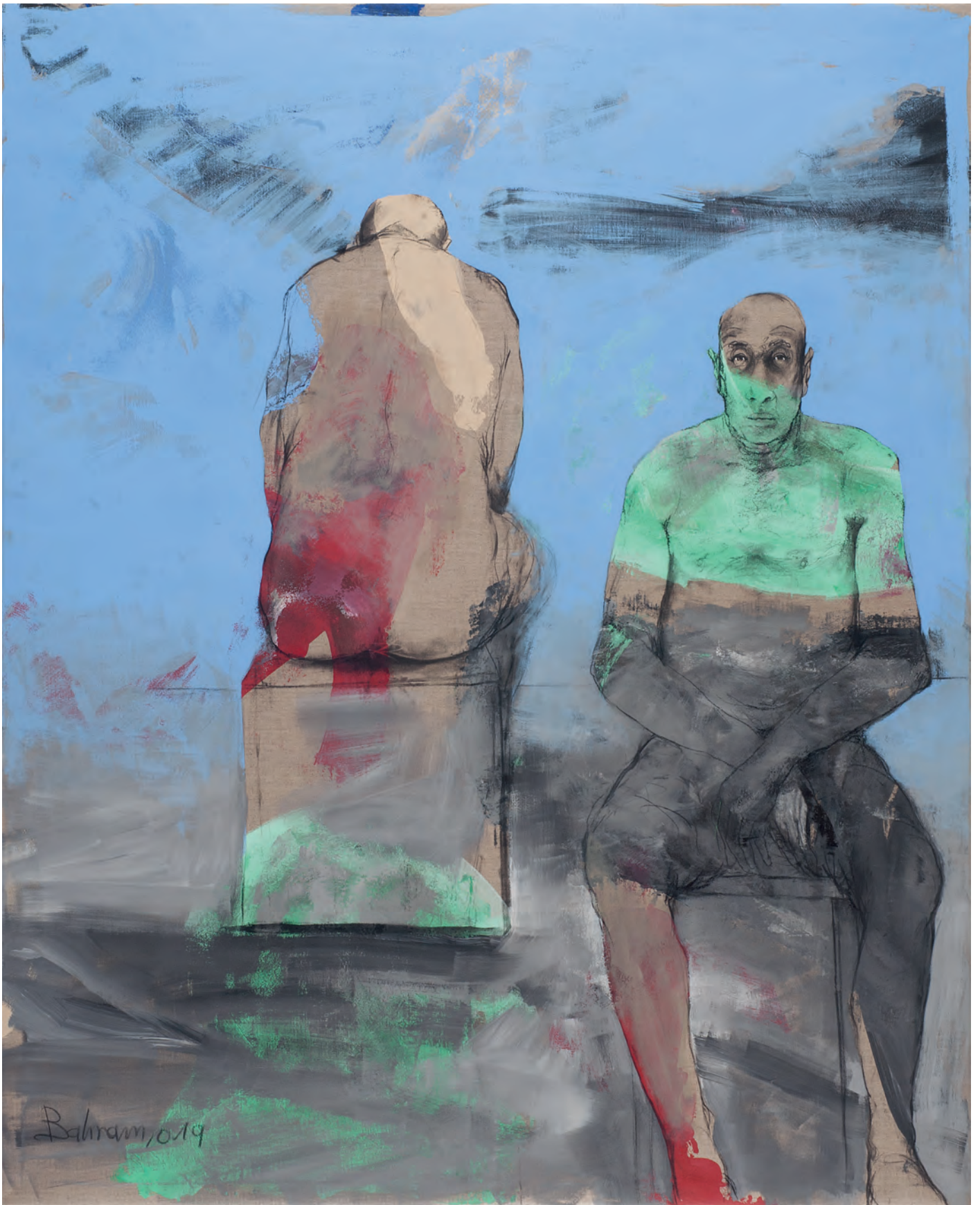
Untitled | 2019 | mixedmedia/canvas | 200 cm x 160 cm