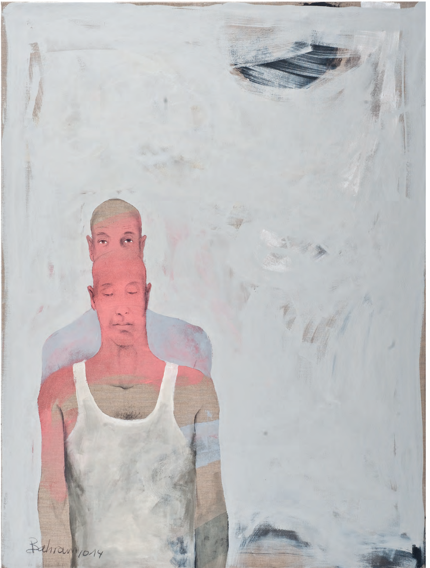
Untitled | 2014 | mixedmedia/canvas | 160 cm x 120 cm