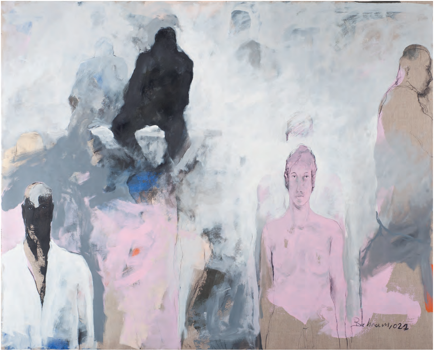
Untitled | 2022 | mixedmedia/canvas | 160 cm x 200 cm