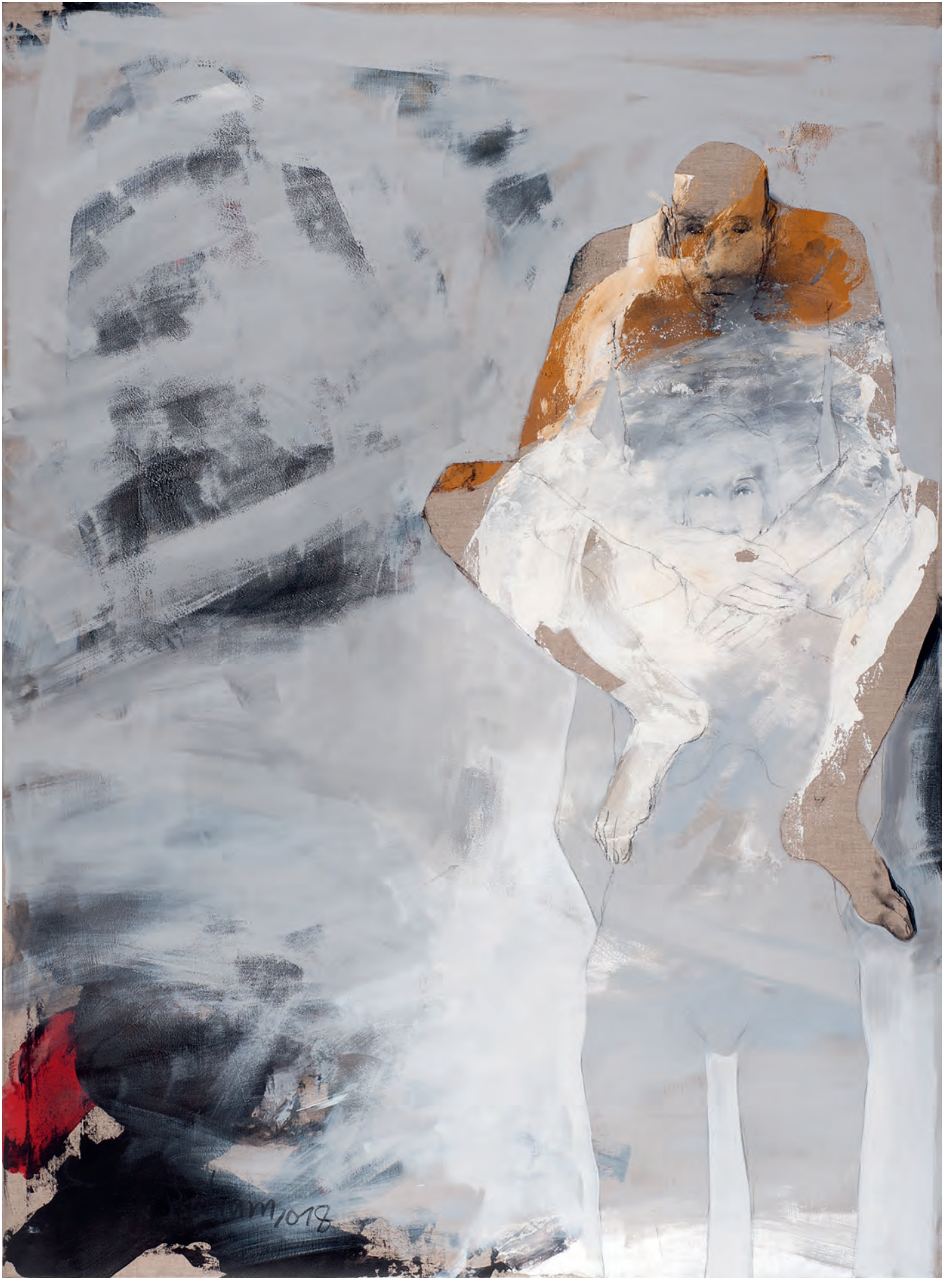
Untitled | 2017 | mixedmedia/canvas | 190 cm x 140 cm