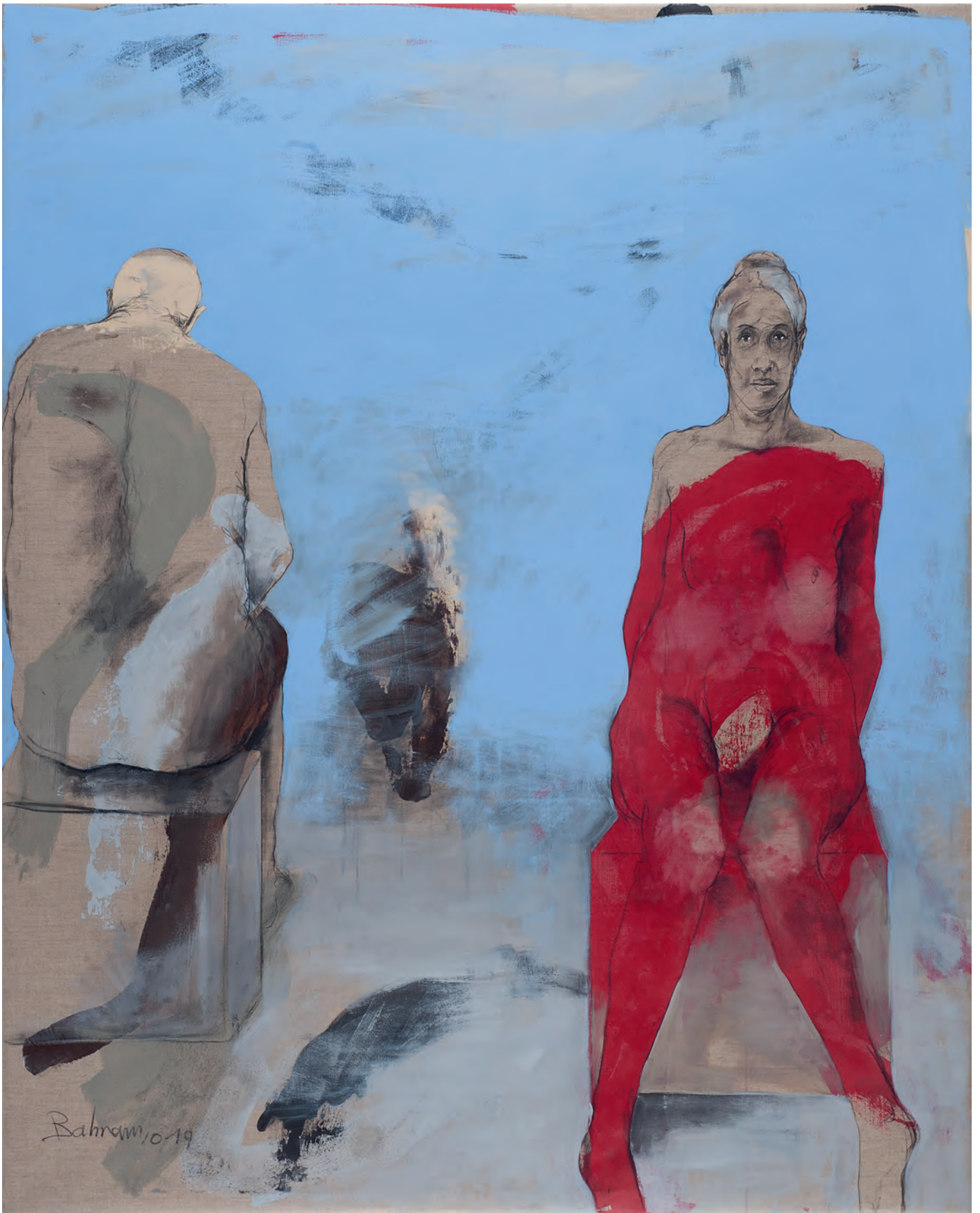
Untitled | 2019 | mixedmedia/canvas | 200 cm x 160 cm